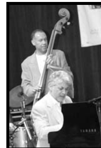
Monty Alexander & John Clayton