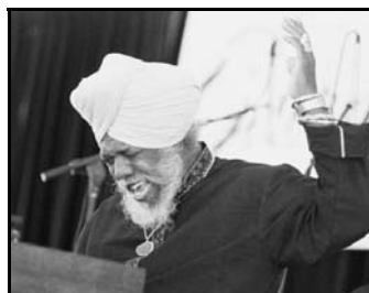
Dr. Lonnie Smith